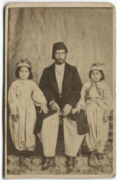
Studio portrait of a man with two children