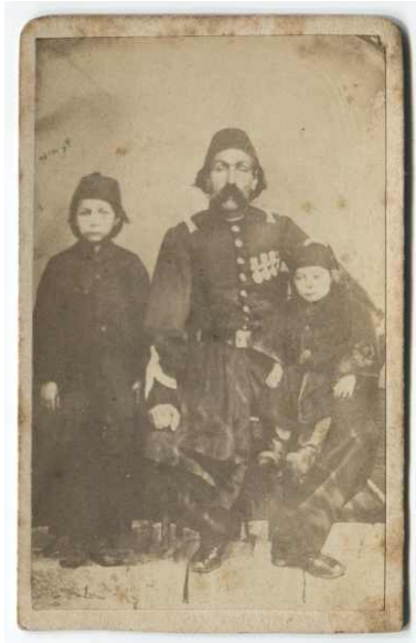
Studio portrait of a man with two children