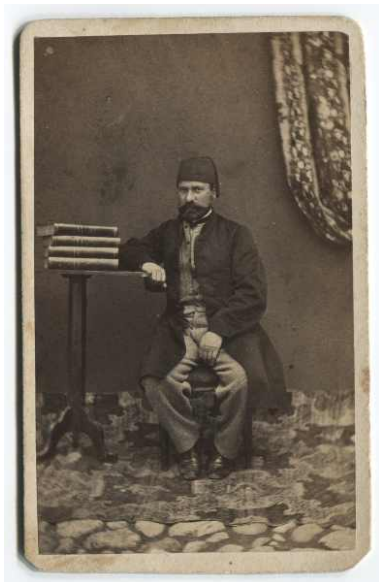
Studio portrait of a man