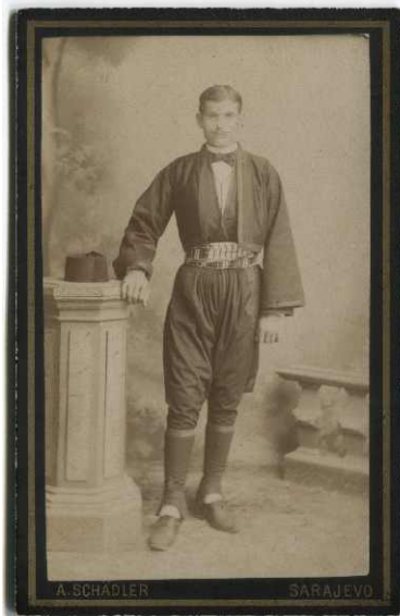
Studio portrait of a man