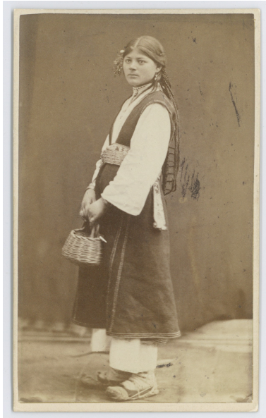
Studio portrait of a young woman in folk attire