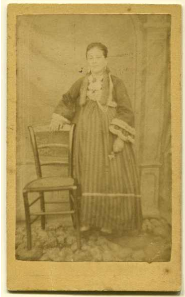
Studio portrait of a woman