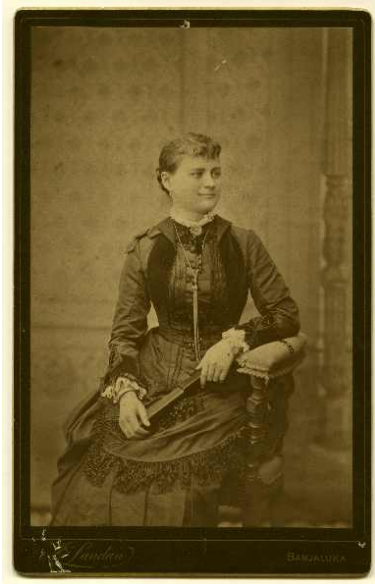
Studio portrait of a townswoman