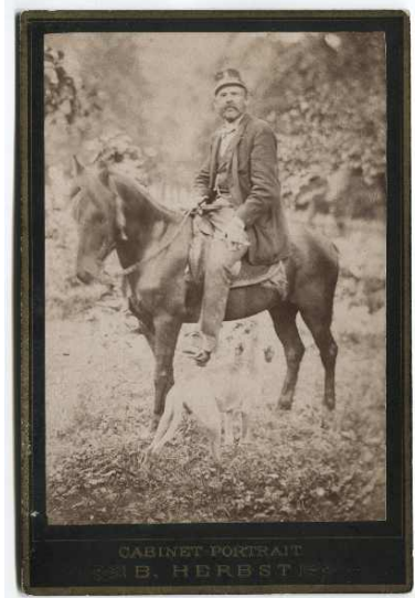
Portrait of Julius Vajler