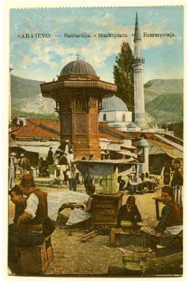
"Sarajevo - Baščaršija - Market Place"