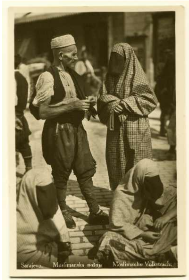
"Sarajevo. Muslim Folk Dresses" © Bosniac Institute - Adil Zulfikarpašić Foundation