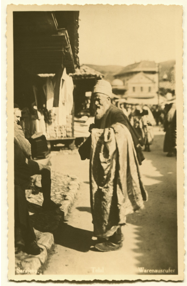
"Sarajevo. Telal. Bell Man At The Market"