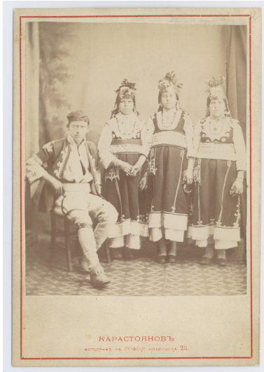
Studio portrait of a man and three women in folk attire