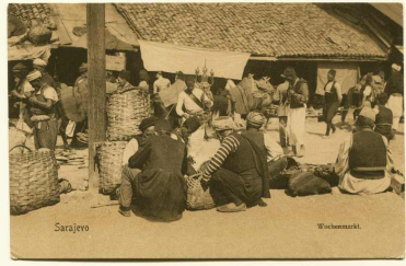
"Sarajevo / Weekly Market"