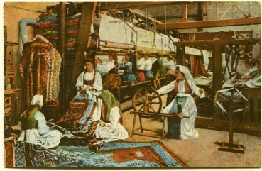
"Sarajevo - Carpet Manufactory"