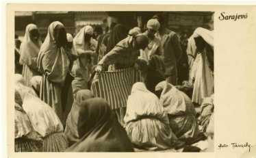
Female street vendors