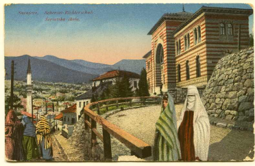
"Sarajevo. The Scharia Law School"