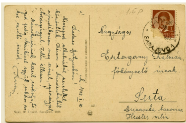
Picture postcard with five medaillons