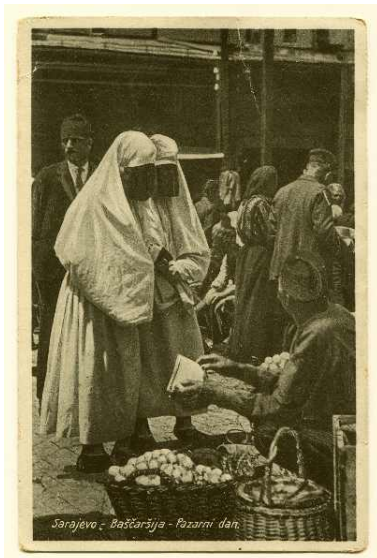
"Sarajevo - Baščaršija - Market Day"