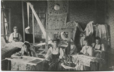
Interior of a textile factory producing bez and embroideries