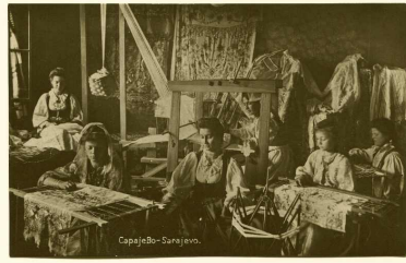
Interior of a textile factory producing bez and embroideries