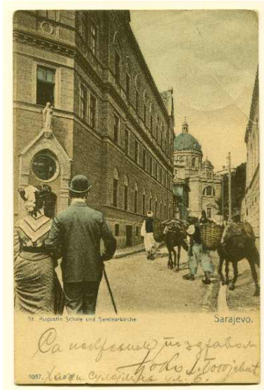
"St. Augustine School And The Seminar Church / Sarajevo"