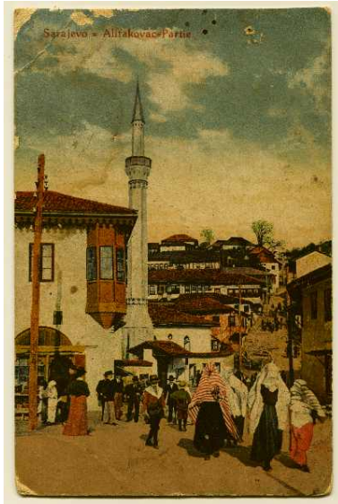
"Sarajevo = Alifakovac"