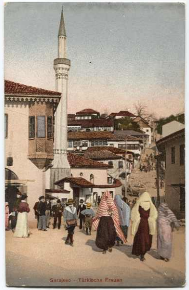
"Sarajevo - Turkish Women"