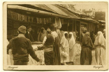
"Sarajevo / Čaršija"