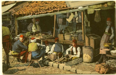
"Sarajevo. Typical Shops (Dučans)"