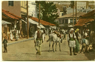
"Part Of Čaršija"