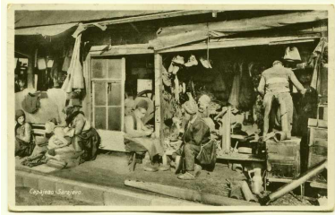
Open-fronted shops in Baščaršija