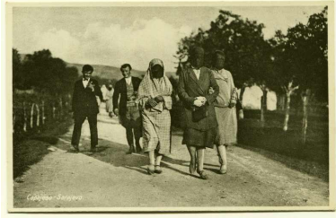
Country way