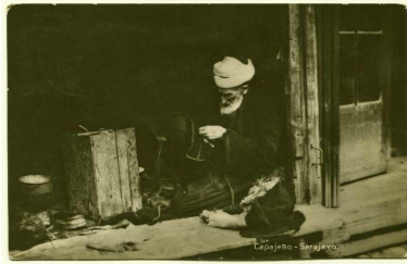
Craftsman at work