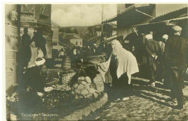
Street vendors at the Sebilj fountain