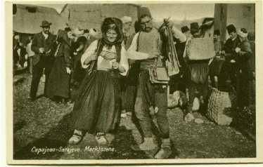
"Sarajevo. Market Scene"