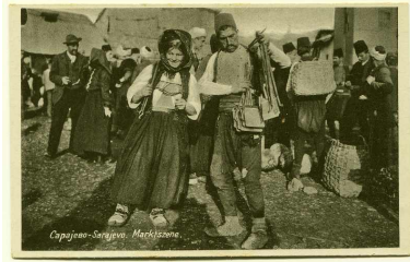
"Sarajevo. Market Scene"