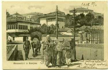
Street life at Šeher-Ćehajin Bridge and Mustaj-pasha's square