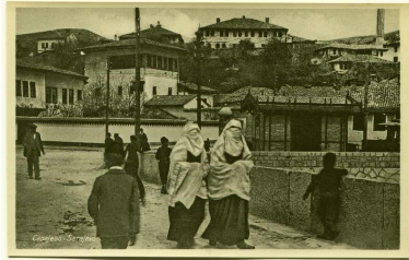
Mustaj-pasha's square (Mustaj pašin mejdan)