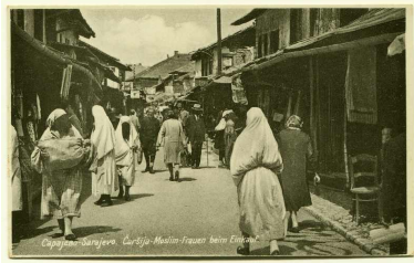
"Sarajevo. Čaršija - Muslim Women Go Shopping"