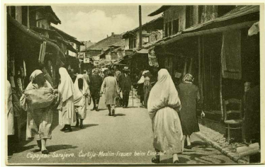
"Sarajevo. Čaršija - Muslim Women Go Shopping"