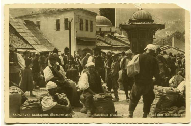
"Sarajevo / Baščaršija / Market Day"