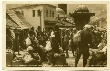
"Sarajevo / Baščaršija / Market Day"