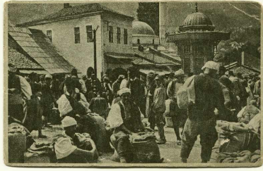
"Sarajevo. Market Day In Baščaršija"