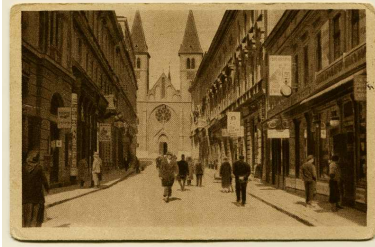
"Sarajevo / Strossmayer's Street"