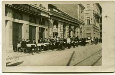
Leisure activities