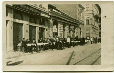
Leisure activities