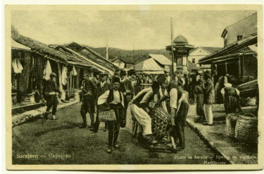
"Sarajevo / Market Scene"