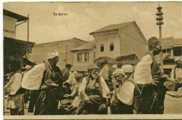
Street vendors in Baščaršija