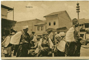
Street vendors in Baščaršija