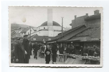
Selling flatbread (somun) in Baščaršija