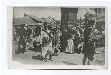
The old Marketplace in Sarajevo