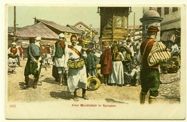
"The Old Marketplace In Sarajevo"