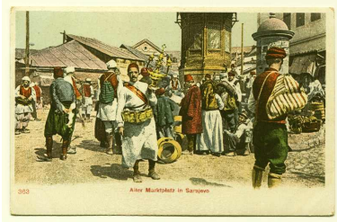
"The Old Marketplace In Sarajevo"