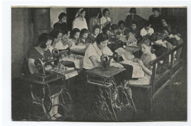
Women and girls making clothes