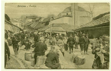
Selling wheat and corn in Baščaršija