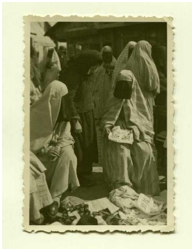
Market scene