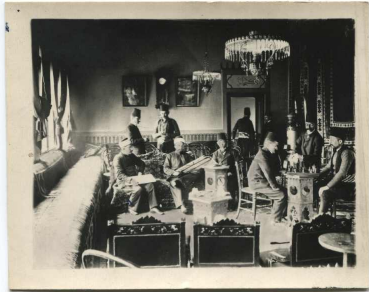
Interior of kiraethane, club and reading room for Muslims