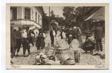
"Nadkovači Street"