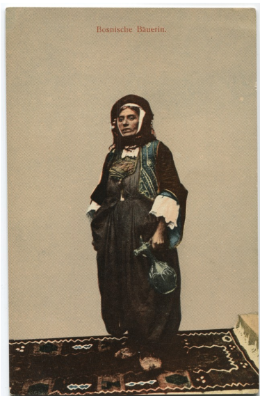
"Bosnian Peasant Woman"