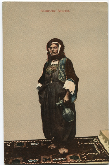
"Bosnian Peasant Woman"